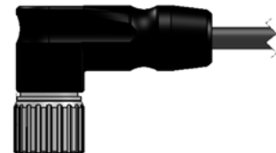
Female (Female Threads) Plug