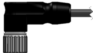
Male (Female Threads) Plug